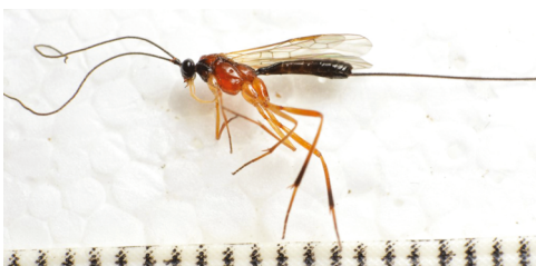
Figure 19. Macrocentrus nitidus (Wesmael, 1835), female, habitus.

Macrocentrus nitidus (Wesmael, 1835) (Fig. 19): 1♀*, Udlejre (Egedal), 55°47'18.3"N 12°08'35.6"E (precision: 10 m), caught indoors, 15.VI.2018, leg. J. Lutz, det. K. van