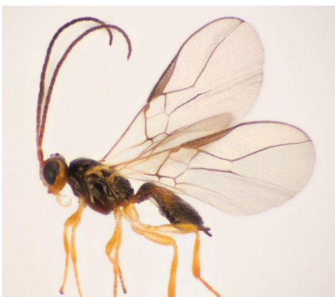
Figure 23. Opilus pulchriceps Szepliget, 1898, female, habitus.

Aleiodes apicalis (Brullé, 1832) (Fig. 25): 1♀, Gram (Skanderborg), 56°03'12.3"N 9°59'42.0"E (precision: 3 m), attracted to light, coll. 26.VII.2019, leg. M. F. Holm, det. M. R. Shaw & M. F.