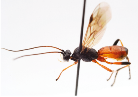
Figure 25. Aleiodes apicalis (Brullé, 1832), female, habitus.

Holm; 1♀*, Bjørnkær (Syddjurs), 56°11'31.6"N 10°41'27.9"E (precision: 40 m), attracted to light, coll. 08.VIII.2020, leg. M. F. Holm, det. M. R. Shaw & M. F. Holm.