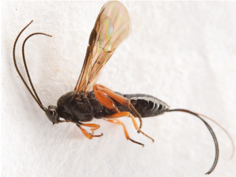
Figure 3. Therophilus tumidulus (Nees, 1812), female, habitus.