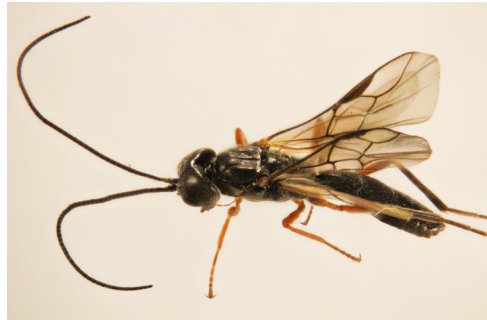
Figure 4. Polemochartus melas (Giraud, 1863), male, habitus.