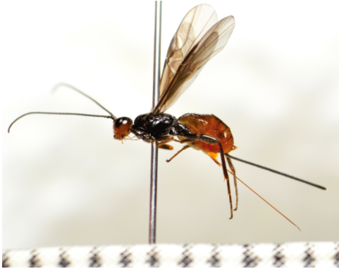
Figure 7. Coeloides forsteri Haeselbarth, 1967, female, habitus.