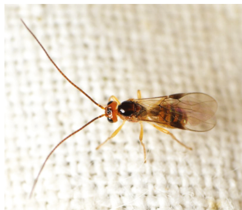
Figure 24. Psyttalia carinata (Thomson, 1895), male, habitus.