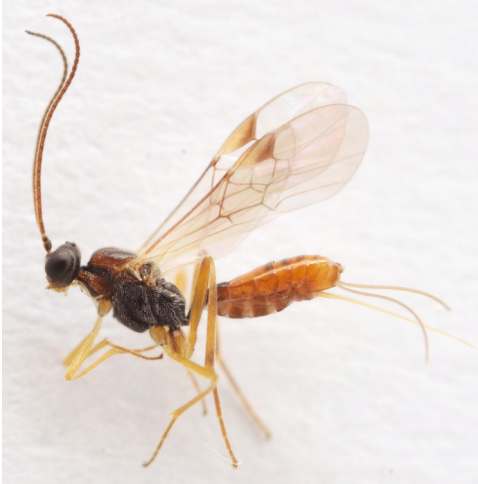
Figure 13. Meteorus affinis (Wesmael, 1835), female, habitus.