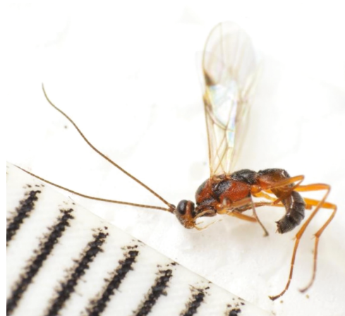
Figure 27. Aleiodes leptofemur van Achterberg & Shaw, 2016, female, habitus.