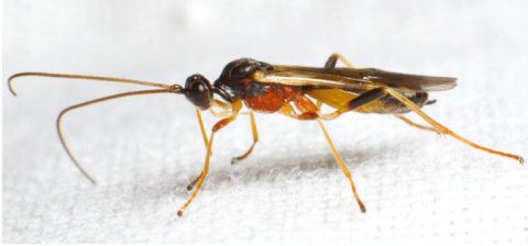
Figure 28. Aleiodes nigriceps Wesmael, 1838, female, habitus.