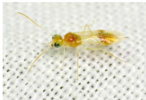
Figure 10. Chrysopophthorus hungaricus (Zilahi-Kiss, 1927), female, habitus.