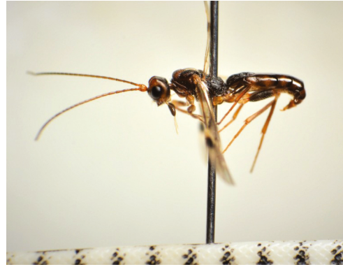
Figure 8. Dendrosoter protuberans (Nees, 1834), male, habitus.

Habrobracon variegator (Spinola, 1808): 1♀, Ebbeskov (Køge), 55°29'44.7"N 11°56'10.3"E (precision: 50 m), caught by hand, 31.VIII.2016, leg. J. Lutz, det. J. Papp.