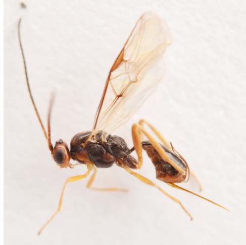
Figure 14. Meteorus obsoletus (Wesmael, 1835), female, habitus.