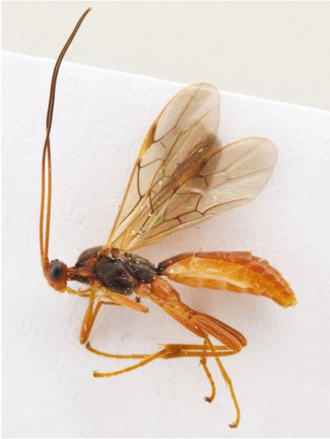
Figure 30. Aleiodes varius (Herrich-Schäffer, 1838), male, habitus.

total of 422 species. However, the total number of braconid species would be 908 if our records are added to the already existing database at Arter.dk – the national species database of Denmark (Skipper et al., 2020). This number is partly based on published records, but is also derived from both updated and outdated names attributed to the many braconid individuals from the collection at the NHMD in Copenhagen. A critical examination of the specimens in NHMD is beyond the scope of this paper.