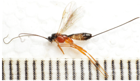
Figure 18. Macrocentrus kurnakovi Tobias, 1976, female, habitus.

Gritsch, det. F. Verheyde; 3♀, Ebbeskov (Køge), 55°29'44.7"N 11°56'10.3"E, attracted to light, 5.VII.2022, leg. J. Lutz, det. K. van Achterberg.