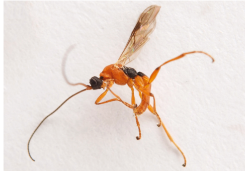
Figure 29. Aleiodes punctipes (Thomson, 1892), male, habitus.

Aleiodes punctipes (Thomson, 1892) (Fig. 29): 1♂*, Brænøre Mose (Kolding), 55°23'54.9"N 9°25'58.2"E (precision: 80 m), caught by sweeping in vegetation, coll. 29.VII.2018, leg. M. F. Holm, det. M. R. Shaw.