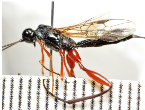
Figure 16. Helcon angustator Nees, 1812, female, habitus.