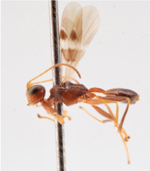
Figure 11. Leiofaron fascipennis (Ruthe, 1856), female, habitus.