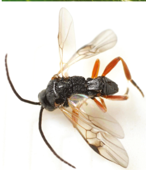
Figure 20. Cotesia spuria (Wesmael, 1837) – top: cocoons on caterpillar of Furcula bifida (Lepidoptera: Notodontidae), bottom: female, habitus.