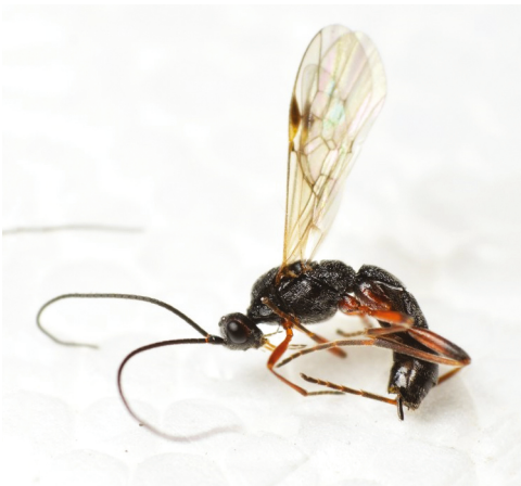
Figure 26. Aleiodes coxalis (Spinola, 1808), female, habitus.

Aleiodes pictus (Herrich-Schäffer, 1838): 1♀, Ebbeskov (Køge), 55°29'44.7"N 11°56'10.3"E (precision: 50 m), attracted to light, 19.VII.2022, leg. J. Lutz, det. K. van Achterberg.