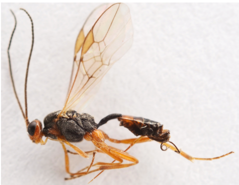
Figure 15. Meteorus ruficeps (Nees, 1834), female, habitus.

Wroughtonia spinator (Lepelletier, 1825): 1♂, Toreby (Guldborgsund), 54°45'08.0"N 11°47'14.2"E (precision: 1000 m), 14.VI.2007, photo F. Krone (specimen not collected), det. J. Lutz; 1♂ 1♀, Thorslund (Faaborg-Midtfyn), 55°12'31.6"N 10°13'12.3"E (precision: 5 m), on cut logs, 5.VI.2018, photo L. Christensen (specimens not collected), det. K. Van Achterberg; 1♀, Pinseskoven (Tårnby), 55° 35'50.38"N 12° 33'15.85"E, malaise trap, 22-25.V.2016, leg. W.