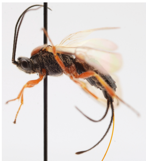
Figure 2. Earinus elator (Fabricius, 1804), female, habitus.

Note: additional unverified specimens are present in NHMD.