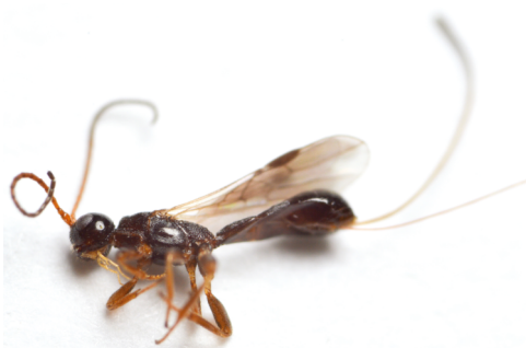
Figure 9. Hecabolus sulcatus Curtis, 1834, female, habitus.

Dendrosoter protuberans (Nees, 1834) (Fig. 8): 3♂, Hvidovre (Hvidovre), 55°38'43.0"N 12°27'51.0"E (precision: 50 m), examining exit holes of Scotylus mali on Pyrus communis , 30.VI.2016, photo J. Ravn Jensen (specimens not collected), det. J. Ravn Jensen & K. van