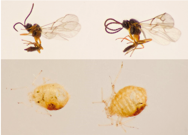
Figure 5. Aphidius setiger (Mackauer, 1961), male and female (above); host aphids ( Periphyllus , below).