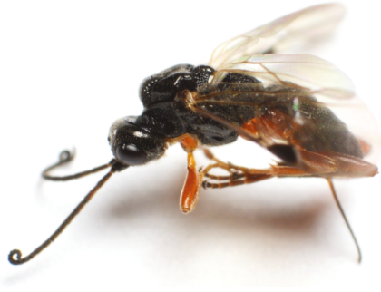
Figure 6. Eubazus nigroventralis van Achterberg, 2003, female, habitus.